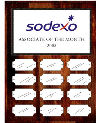
PERPETUAL PLAQUES (10 1/2" x 13") with 12 plates