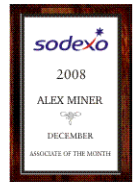
(4" x 6") INDIVIDUAL PLAQUE for employee of the month or quarter

Please check one: Silver Plates Gold Plates