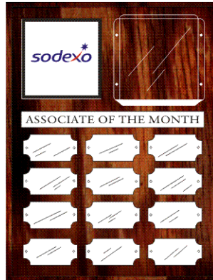
STYLE A (with photo holder)