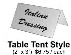
Table Tent Style (2" x 3") $6.75 / each