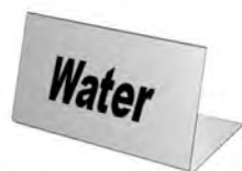
L-shaped Sign (2" x 3") $6.75 / each