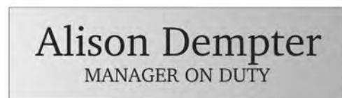
Name Plates (2" x 8") $8.55 / each