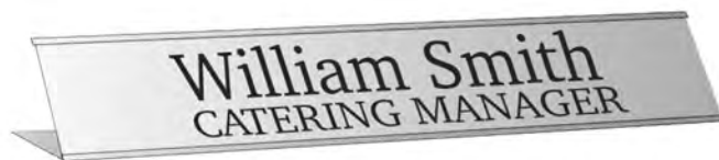
Name Plate Sliders and Holders (2" x 10")